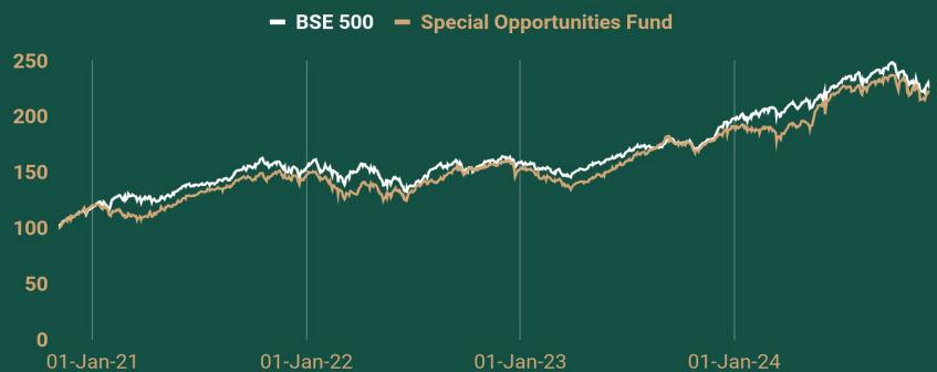
BSE 500 NAV and Special Opportunities Fund