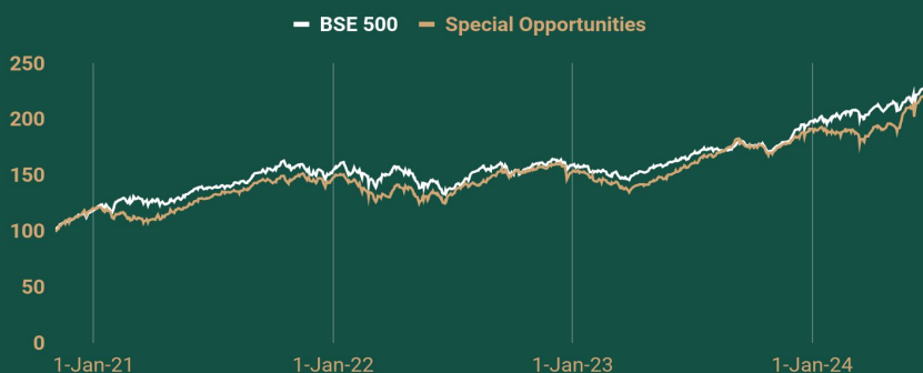
BSE 500 NAV and Special Opportunities