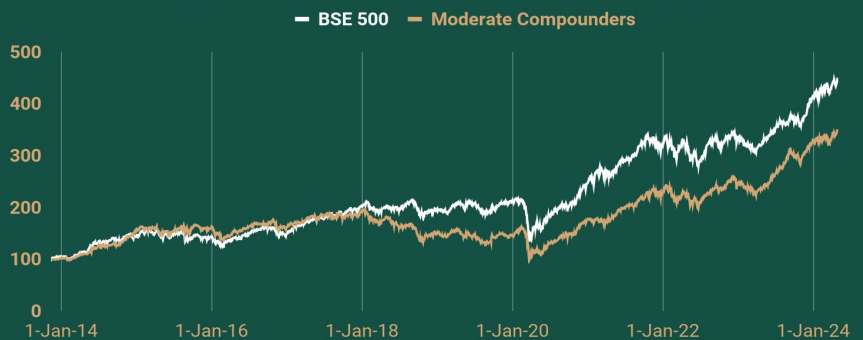
BSE 500 NAV and Moderate Compounders