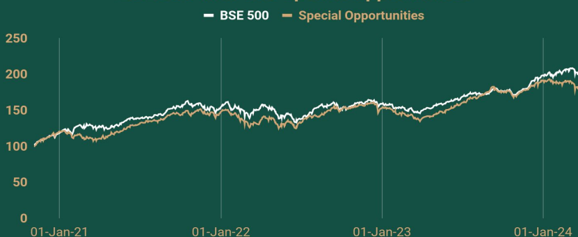
BSE 500 NAV and Special Opportunities