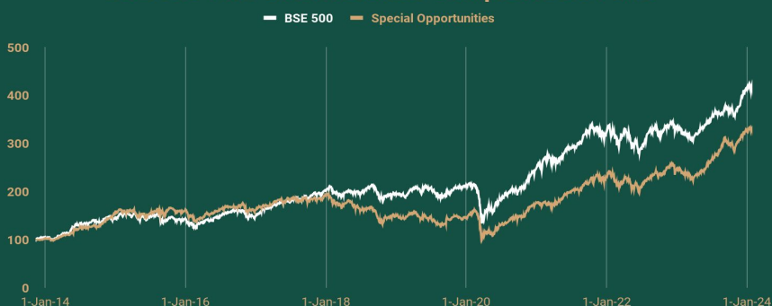
BSE 500 NAV and Moderate Compounders Fund