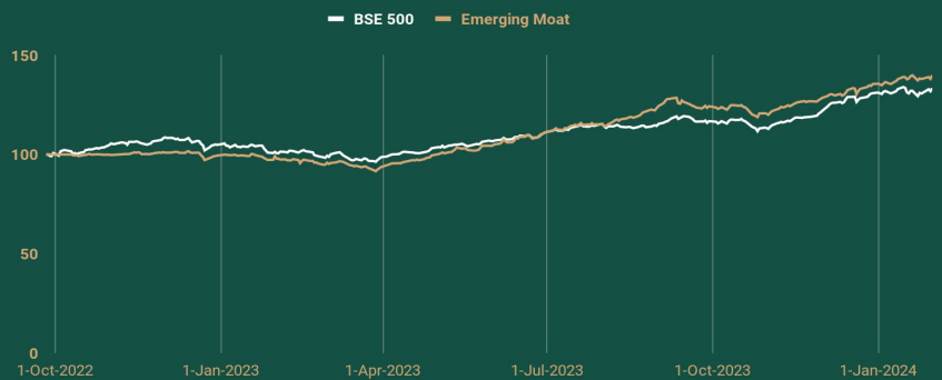
BSE 500 NAV and Emerging Moat Fund