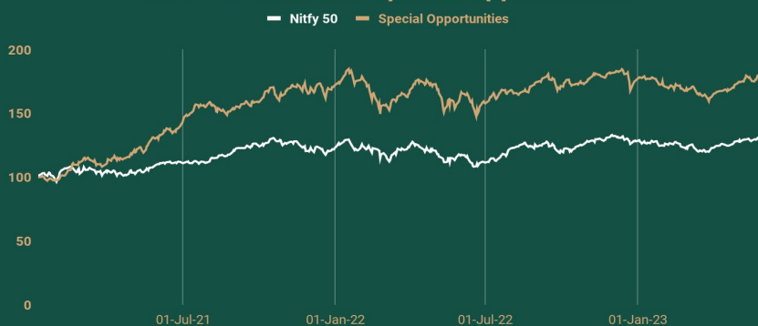
NIFTY 50 NAV and Special Opportunities